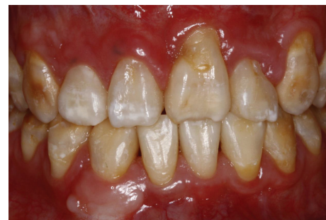
FIGURE 3: Close-up view of the anterior teeth after orthodontic treatment. Note the compromised aesthetics due to enamel hypoplasia and anatomic discrepancies of form, shape, and color.

considered to be not reproducing the harmonious architecture (Figures 2 and 3). However, no periodontal surgery was done because the gingival margin does not become visible in her smile. This was discussed with the patient and her wish was respected.