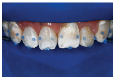
FIGURE 7: Simplified technique for rubber dam placement and acid etching at restricted points of the enamel surface was performed to diagnostic mock-up and tissue conditioning.

for elimination of tooth-size discrepancy between central incisors. A mock-up restoration to more accurately define color and shape was previously done before the cosmetic remodeling by addition of material. An acid etching was performed at restricted points of the enamel surface [16] (Figures 7, 8, and 9).