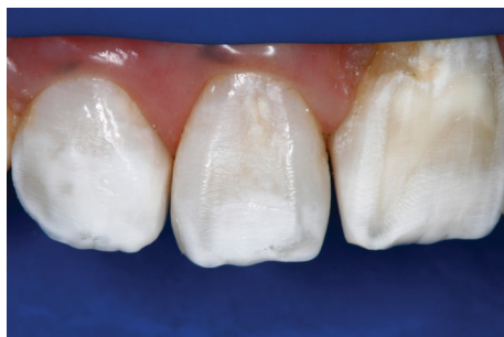
FIGURE 8: Following the grinding of the upper left central incisor with diamond disk to improve symmetry across the midline and tooth discrepancies.