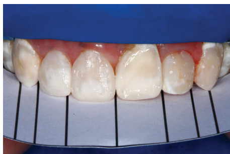
FIGURE 9: Mock-up with composite resin.