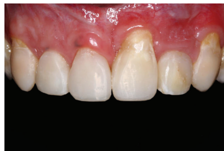
FIGURE 10: Close-up view of the anterior teeth after finishing and polishing the direct adhesive restorations.