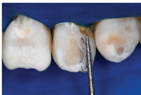
FIGURE 5: After application of hydrogen peroxide gel on the surface of the anterior teeth in agreement with the immediate bleaching procedure, remodeling by grinding of the supernumerary enamel's surface with 3203# bur.

instructions. And so with the aid of a synthetic rubber and gear reduction angle superficial enamel discoloration was removed after two applications (Figure 4). Water spray was applied between each application.