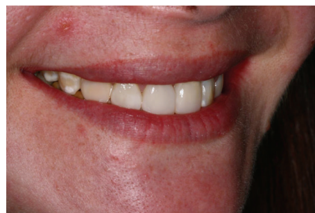
FIGURE 11: The harmony of the dental composition and the smile was reestablished after remodeling management.

imperative role in the final outcome of the treatment because the existence of enamel hypoplasia or supernumerary teeth may disturb the harmony of the smile [12]. In the case presented, either direct resin composite or indirect porcelain veneers could be performed. However a more conservative management can be indicated preceding more invasive therapies.