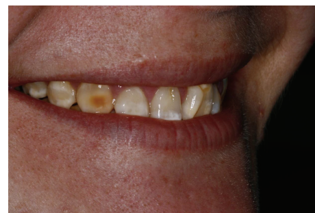
FIGURE 2: Preoperative view of patient's smile with cleidocranial dysplasia after orthodontic treatment.

Female patient, 25 years old, with cleidocranial dysplasia, presented for treatment to the Department of Restorative Dentistry, Bauru School of Dentistry, University of São Paulo, Brazil. Medical history revealed that orthodontics and maxillofacial surgery were previously involved (Figures 1(a) and 1(b)). Radiographic images and clinical exam were made. Clinically, enamel hypoplasia, different shape, and form were observed in all anterior dental composition. In addition, the gingival contouring was evaluated and