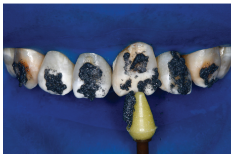
FIGURE 4: After rubber dam placement, application of the microabrasive product on the surface of the stained enamel with intermittent appliance.